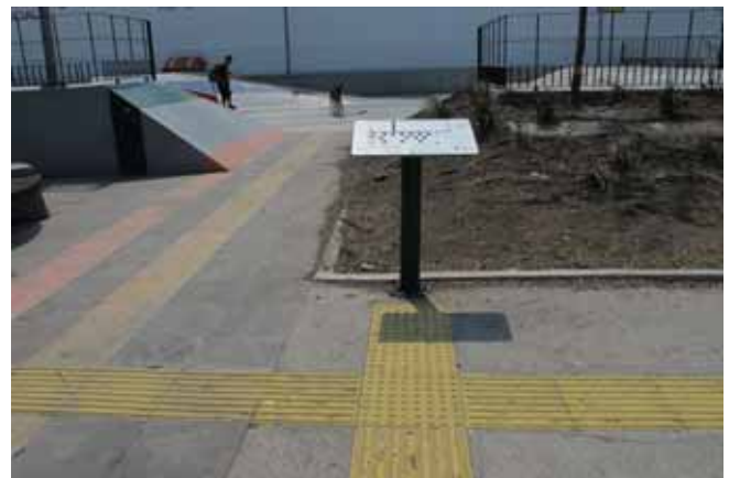
Picture 1: Tactile walking surface indicators and tactile map.

Pillar 1. Social. Since early stages, inclusion for all persons was considered. Universal design principles were used in the design proposal. For example, a pedestrian ramp to the children's playground, tactile walking surface indicators (TWSI), tactile-visual maps for orientation, visual contrast for different building elements, and functional handrails. An access consultant made sure that access features were integrated into the design concept.