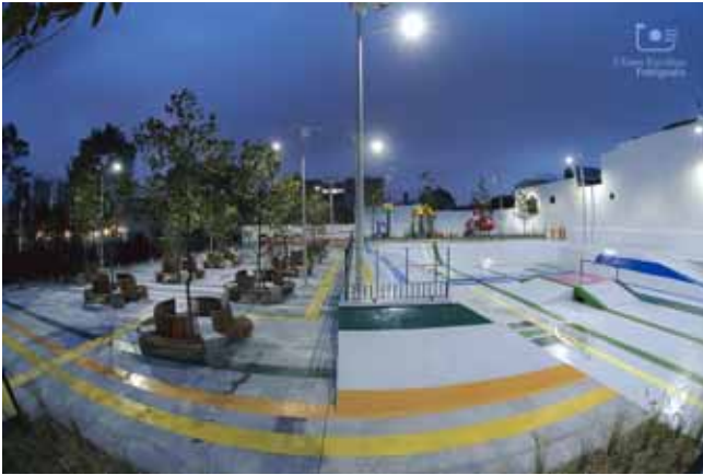
Picture 2: Central Plaza and Skate Park at night.

Pillar 2. Environmental. Green areas were incorporated into the design by planting 22 trees to provide oxygen and increase permeable floor surfaces. An automated irrigation system was installed for watering the green areas with minimal use of water. Solar-powered lightings were installed.