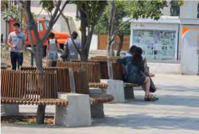
Picture 3: Sitting area at Central Plaza.