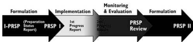
Figure 2: Stages in the PRSP Formation Process

since the very onset of this poverty alleviation model in 1999/2000. As Figure 2 illustrates, the PRSP process dictates that it be essentially predicated upon broad-based consultations of all layers of society, involving the poor themselves as its integral part (ILO 2002). A substantive reading of all of the PRSP regimes so far formulated and implemented by Ethiopia reveal that disability has hardly been considered as a matter of serious development concern. Three PRSP documents have been formulated by the Ethiopian government between 2000-2011. Representatives of PWDs interviewed in this study have all provided firsthand accounts of the actual level of involvement by PWDs and their organisations in the processes and subsequent adoptions of the three PRSP documents.