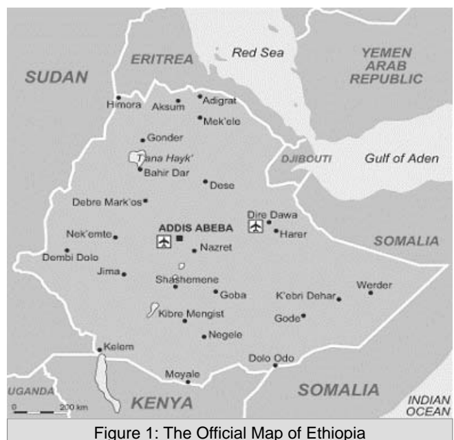
Figure 1: The Official Map of Ethiopia

Poverty and inadequate socio-economic participation of persons with disabilities (PWDs) have, since time immemorial, been the distinctive features of the disability sector and movement in Ethiopia (ENALP 2004). Persons with disabilities form part of every community and