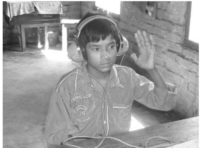
Children attending camps undergo field audiometry

The children were examined in a medical camp setting for approximately 100 children per day, which together with their accompanying family members, is a large crowd. Stagge-