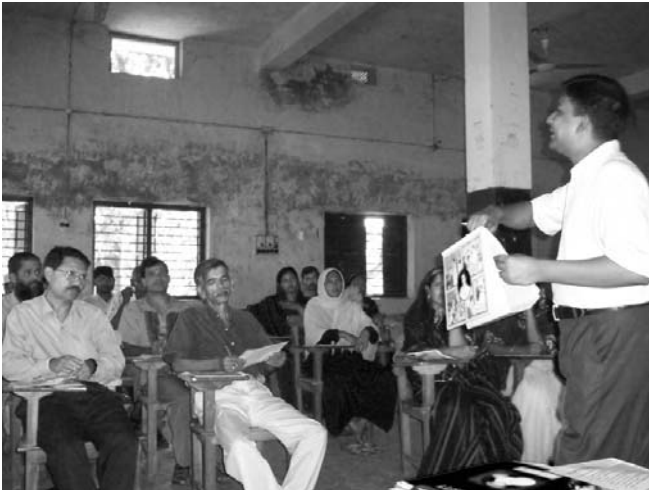
Community Mobiliser using the flip chart for KI training

demographics such as age, gender, parental literacy and geographical location. Thus, the data collected may inform both health and education planners.