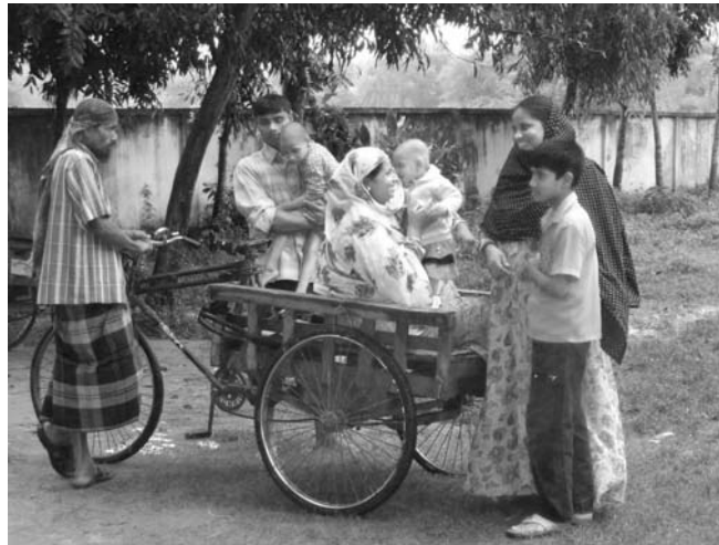
Bringing their children to the KIM assessment camp from further away using local transportation

According to need, referrals were made for further investigations, medication, surgery, plaster, assistive devices or therapy. Prior to the KIM camps, a focussed service mapping was carried out in the districts. Where possible, service provision was made through established local systems, or when necessary to further more specialised treatment centres. Some referrals were to routine health facilities but a large number of other children required specialised services such as surgery for cleft lip, cataract, or club foot, or more complex services such as assistive devices - hearing aids or wheelchairs. From the results estimates can be made for planning purposes for larger populations.