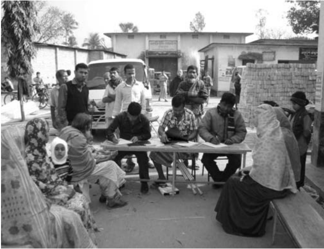
Members from a local self help group working alongside our community mobilisers to register the families at the KIM camp.